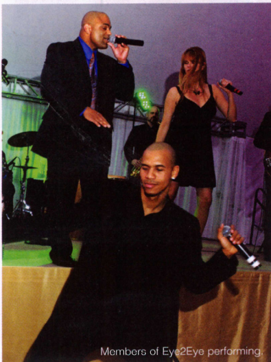
Members of Eye2Eye performing.