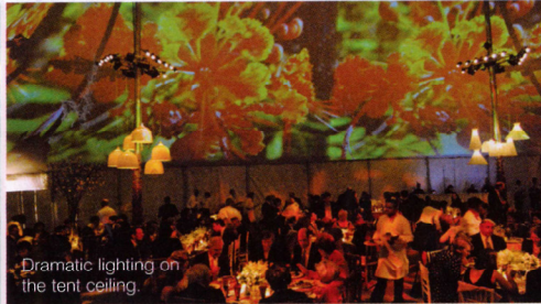
Dramatic lighting on the tent ceiling.