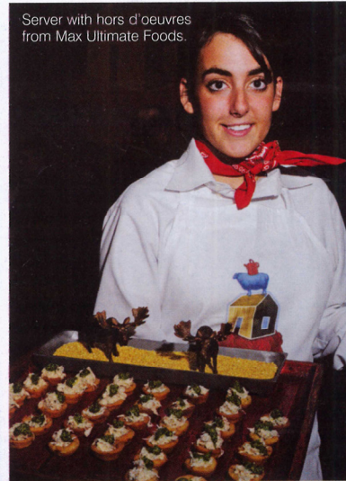
Server with hors d'oeuvres from Max Ultimate Foods.